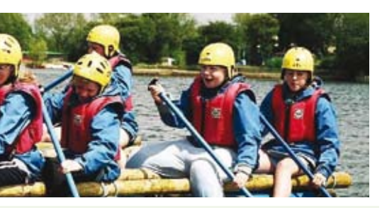
adventurous activities in new and challenging environments away from their local area, with unique opportunities for personal and social development. They are often among the most memorable experiences of a young person's school career.